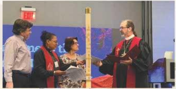
Reception of Hope Lutheran Church, North Greenbush