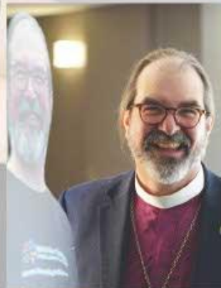
Two Bishop Lees?!