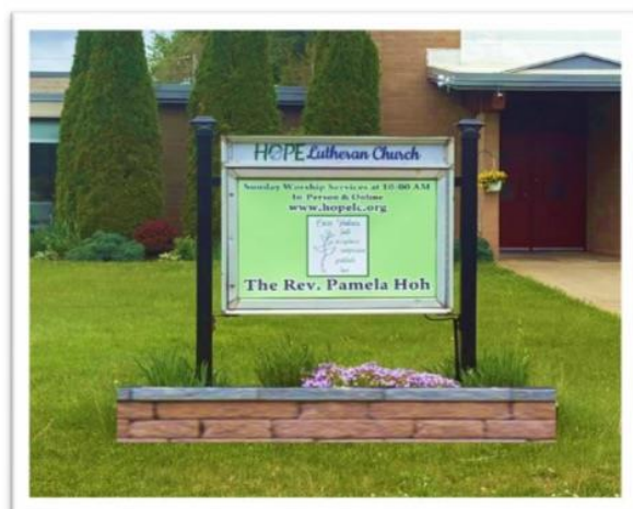
AFTER ~ color of bricks may be a little different